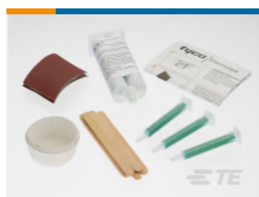
TE Part # 657863-000 S1125-KIT-8